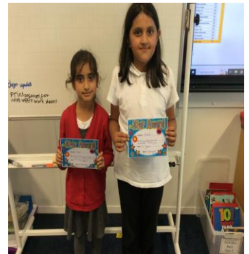
Kindness in Y5