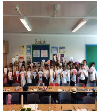
One-word Goals in Y5