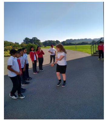
Conscience Alley in Y6