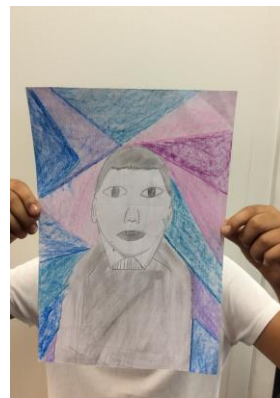
Portraits in Y6