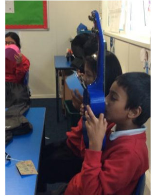
Ukulele in Y3