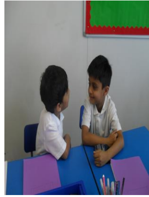
Y3 Learning Partners