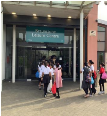
Swimming in Y4