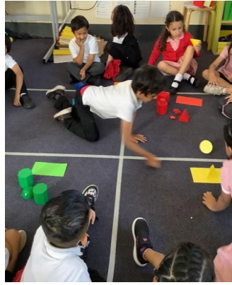
Shape sorting in Y1