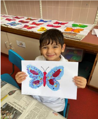
Butterfly art in Y1

Here is a small selection of some of the amazing things that have been happening in school since the beginning of term: