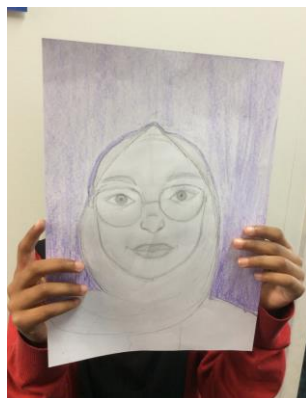
Portraits in Y6