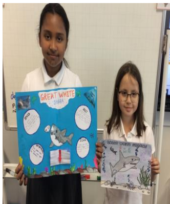
Shark research in Y5