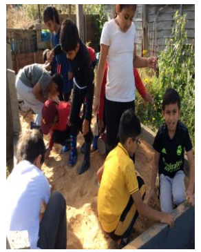
Allotment visit Y2