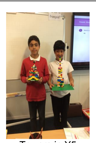
Towers in Y5