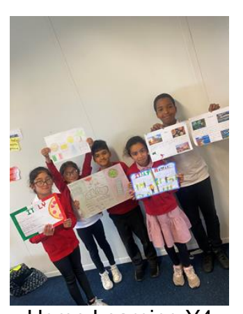
Home Learning Y4