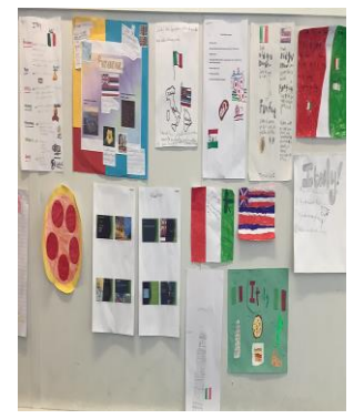
Home Learning Y4