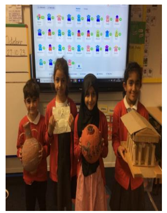
History – Y3