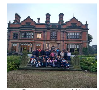
Beaumanor - Y6