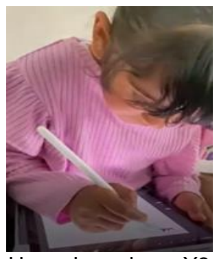
Home Learning – Y3