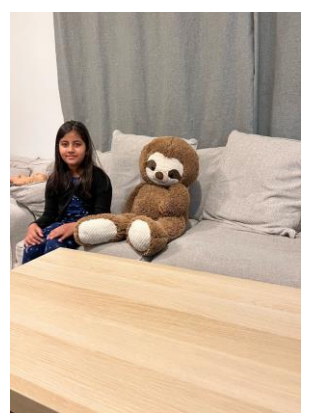
Home Learning – Y3