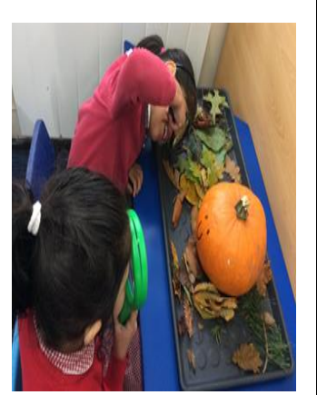
Autumn – Y1