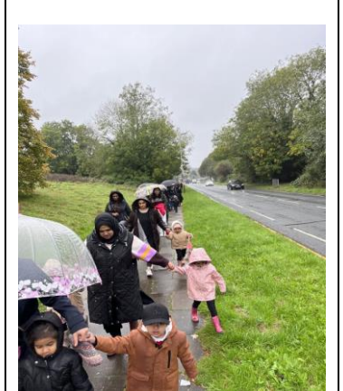
Evington Park (F1)

Here is a small selection of some of the amazing things that have been happening in school this week: