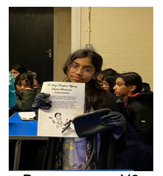
Beaumanor - Y6